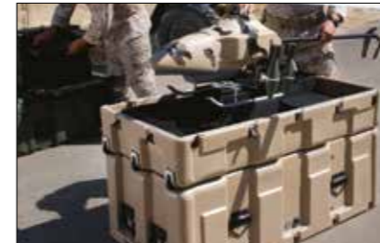
UNMANNED AIRCRAFT VEHICLE

+ +60 YEARS OF EXTREME APPLICATIONS HAVE FORGED OUR TECHNICAL EXPERTISE. CONTACT US FOR OTHER CASE STUDIES.