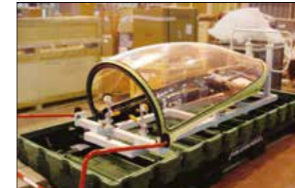
AIRCRAFT CANOPY DECK