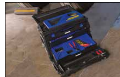
PORTABLE MECHANICS TOOL KIT