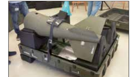
WEAPON GUIDANCE KIT