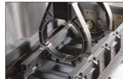
SHOCK MOUNTED SOLUTION FOR UAV