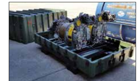
TURBO ENGINE PT6