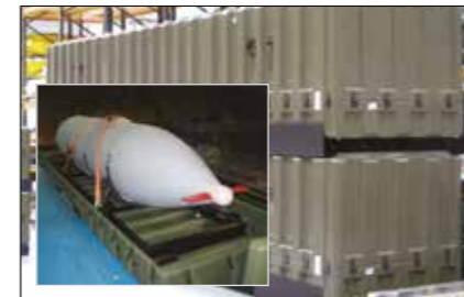
AIR TO AIR REFUELING POD