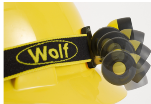
A tilt mechanism allows the beam to be directed where needed