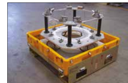
ENGINE COMPRESSOR MODULE