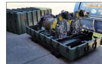
TURBO ENGINE PT6