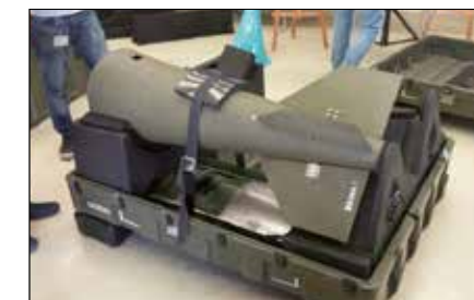
WEAPON GUIDANCE KIT