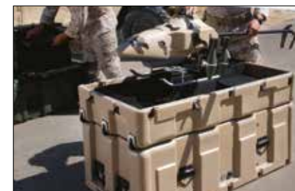
UNMANNED AIRCRAFT VEHICLE

+ +60 YEARS OF EXTREME APPLICATIONS HAVE FORGED OUR TECHNICAL EXPERTISE. CONTACT US FOR OTHER CASE STUDIES.