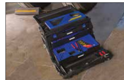
PORTABLE MECHANICS TOOL KIT