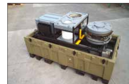
C130 PROPELLER EXCHANGE KIT