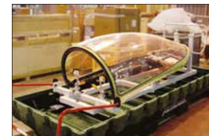
AIRCRAFT CANOPY DECK