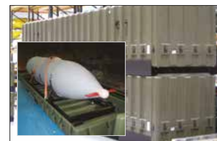
AIR TO AIR REFUELING POD