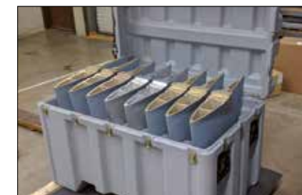
WEAPON GUIDED FINS