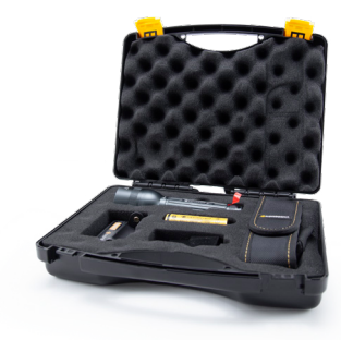
PE PORTABLE BOX WITH SPACE FOR SECOND BATTERY