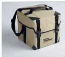
4 LITRES PAYLOAD