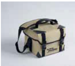
2 LITRES PAYLOAD