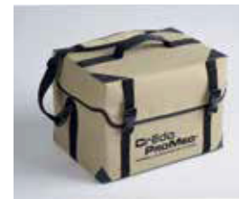
8 LITRES PAYLOAD